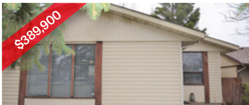
Bowness Investment Property