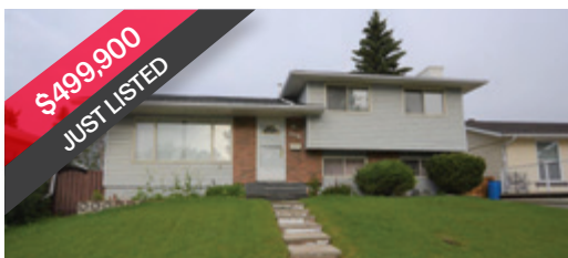
4 Level Split Varsity Acres