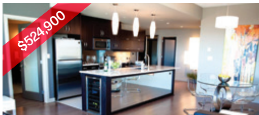
Large 2 Bed 2 Bath Beltline Condo