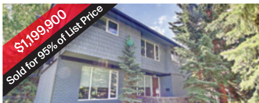
Large Renovated Home on Silver Springs Golf Course