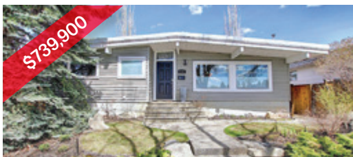
Renovated Varsity Bungalow