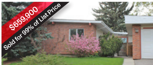
Large Varsity Bungalow

REMAX Real Estate (Mountain View) Suite 222, 4625 Varsity Dr. NW, Calgary, AB T2T 0E3