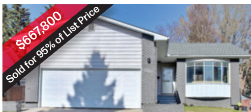
6115 Dalcastle Cr. NW