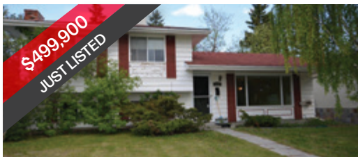
6012 Dalgetty Drive